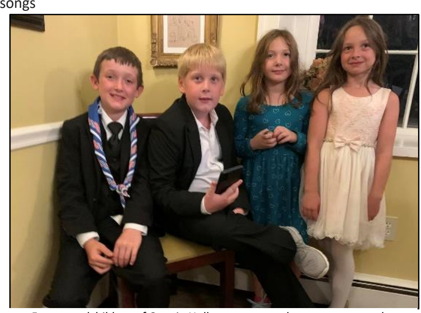
Four grandchildren of Connie Hull were among the partygoers at the Plumsteadville Inn, in Plumstead, Pa.

hadn't seen each other in years. Husbands and wives were decked out black-tie finery and the room positively buzzed with the friendly chatter of adults and the excited laughter of children.